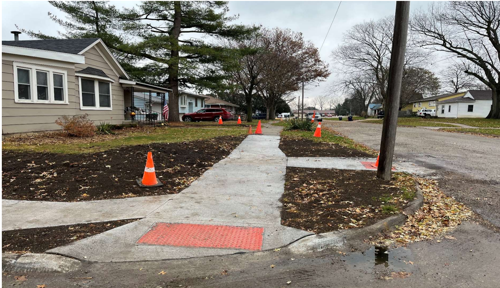
ADA Ramps Completed