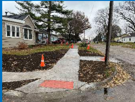
ADA Ramps Completed