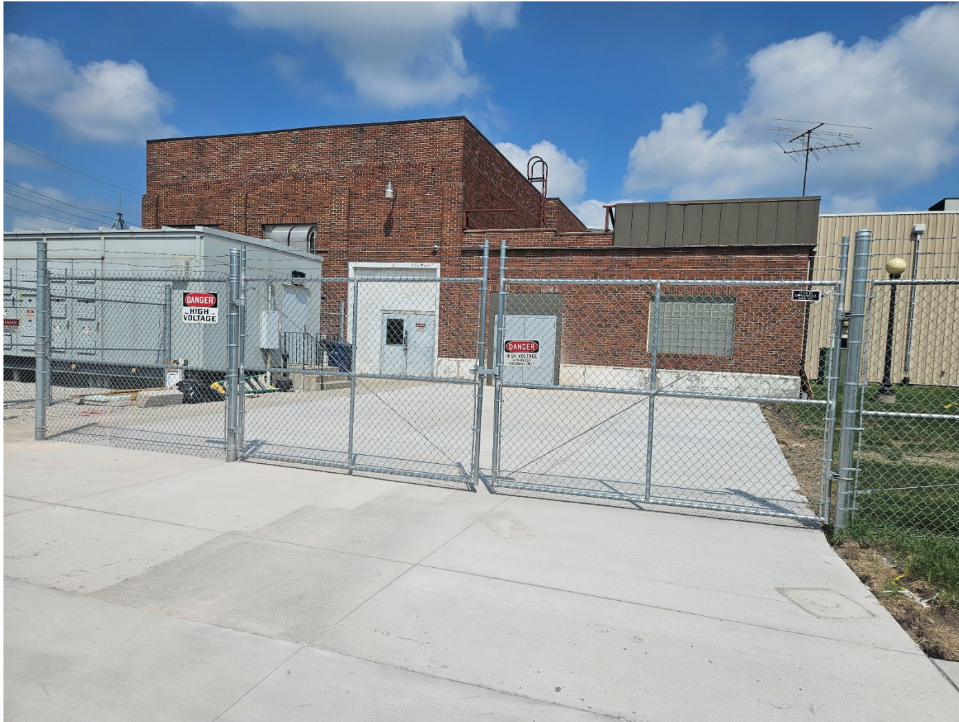
Phase II - New Pumphouse Driveway

West Liberty Well No. 2 and Powerhouse Improvements Project Weekly Progress Report