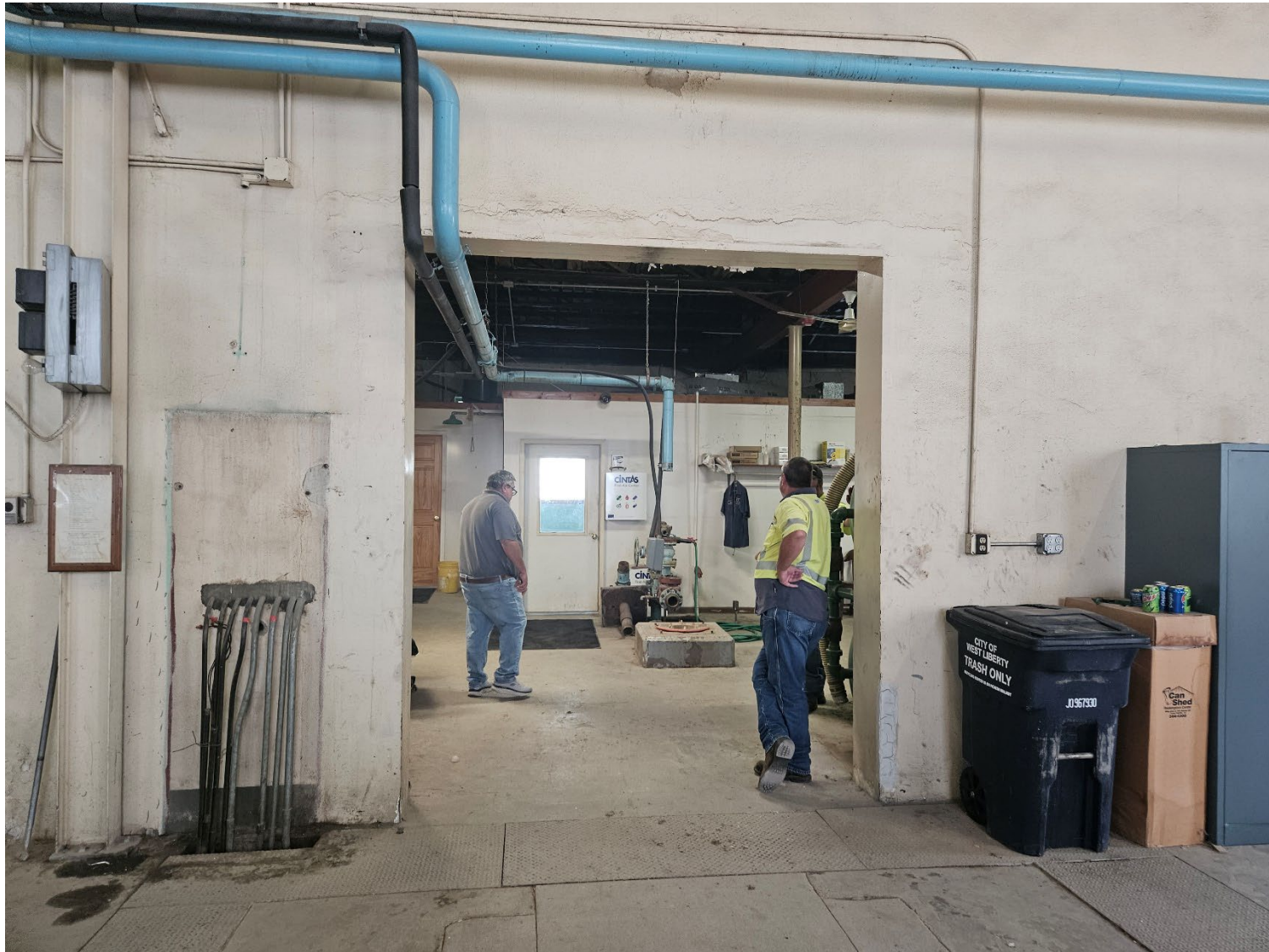
Phase II - Opening for Roll-Up Coil Door

West Liberty Well No. 2 and Powerhouse Improvements Project Weekly Progress Report