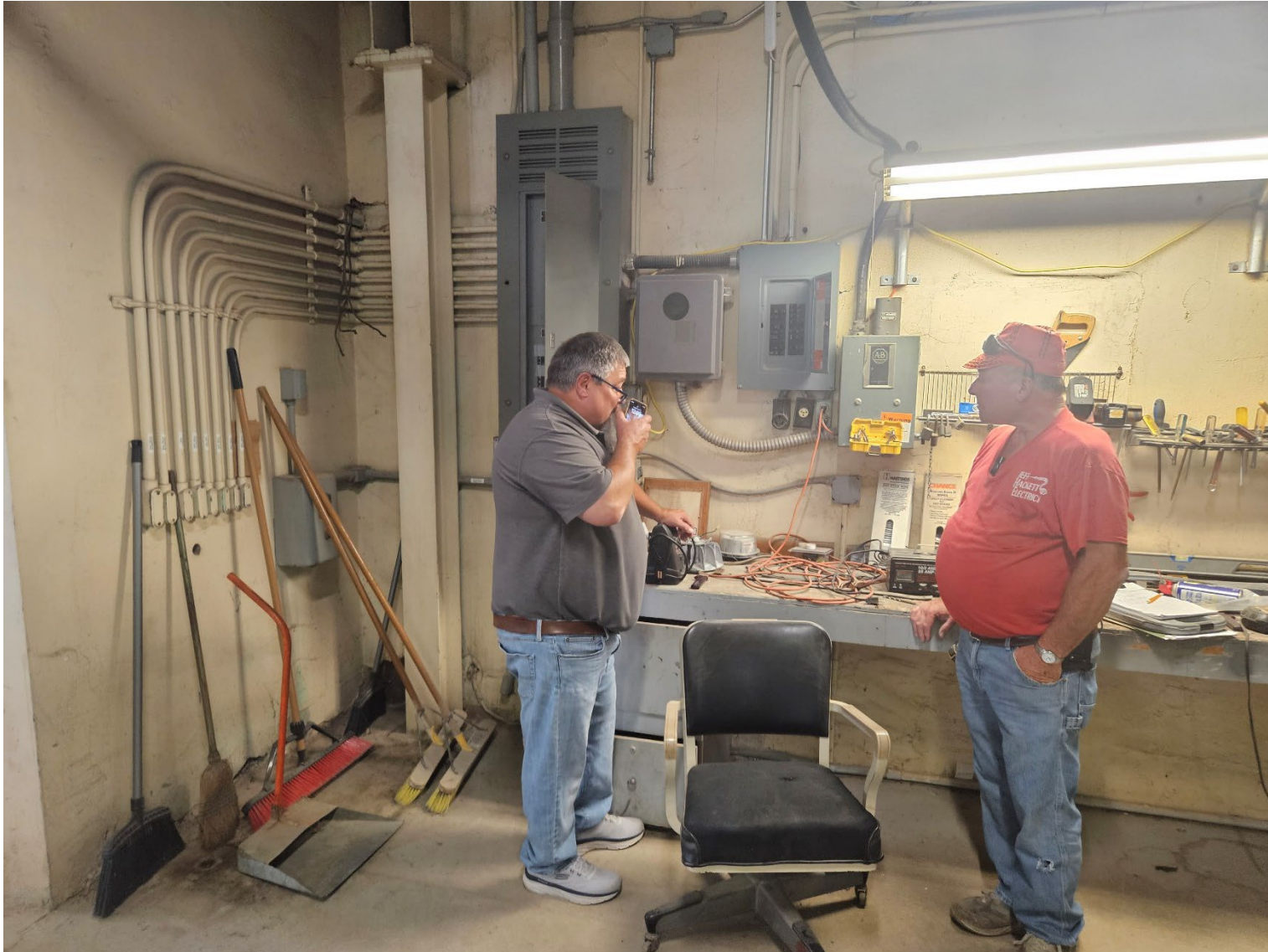
Phase I - Contractors Viewing Electrical Work

West Liberty Well No. 2 and Powerhouse Improvements Project Weekly Progress Report