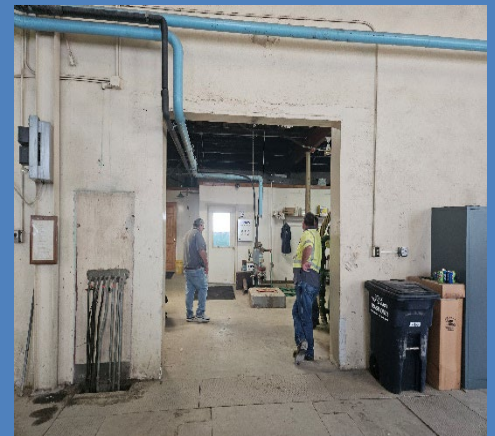
Phase II - Opening for Roll-Up Coil Door