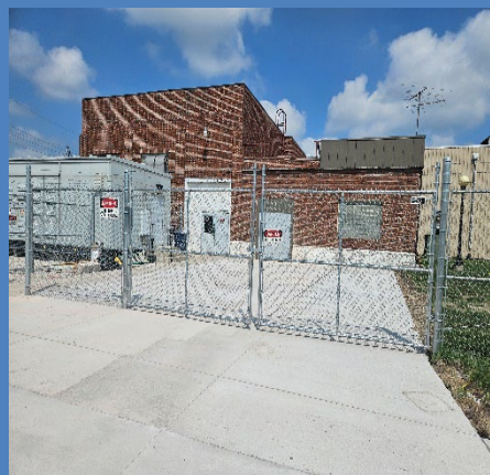
Phase II - New Pumphouse Driveway