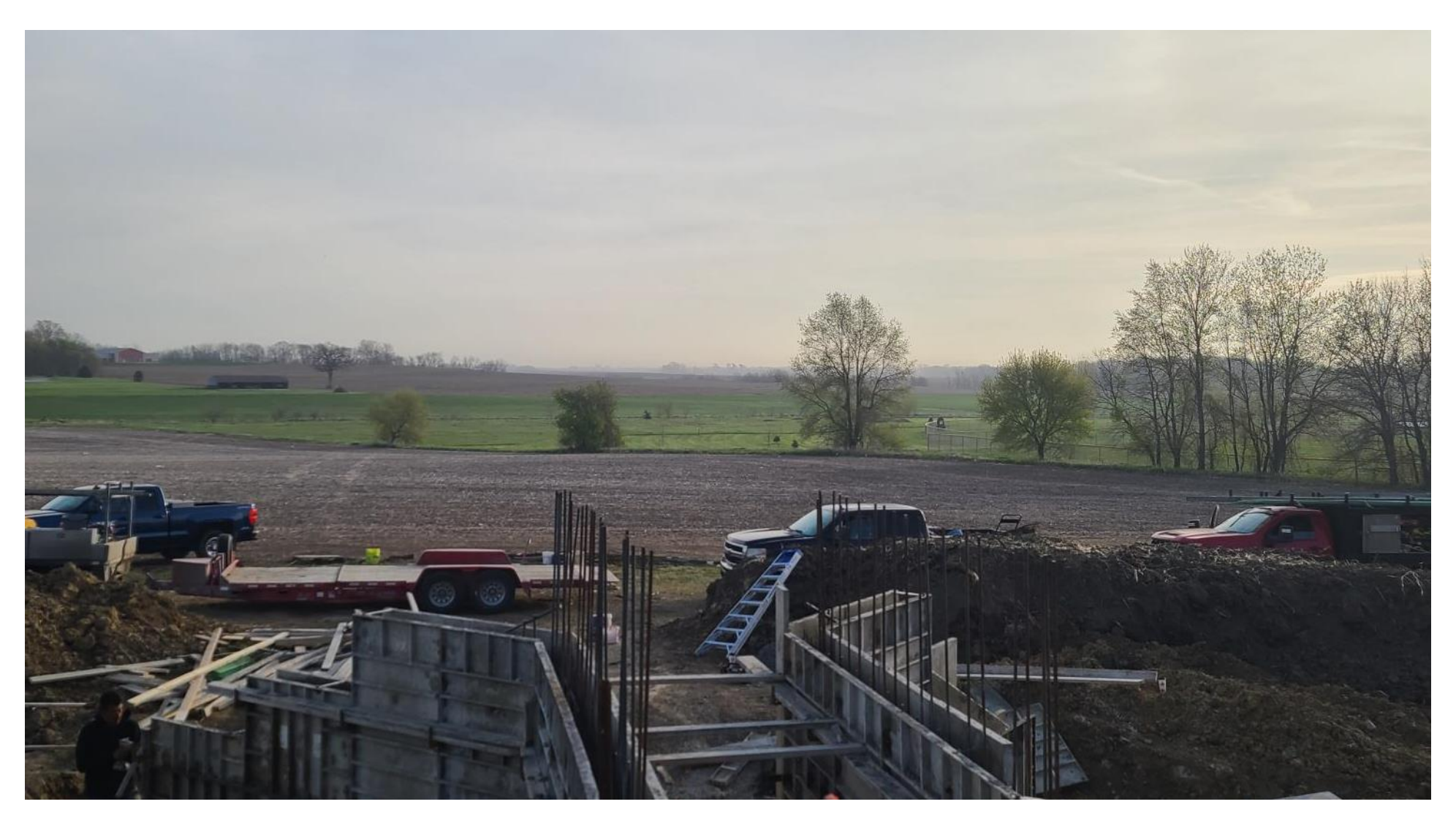
Culvert Ext. Wing Walls Forming for Top

West Liberty Rainbow & Maxson Project Weekly Project Newsletter