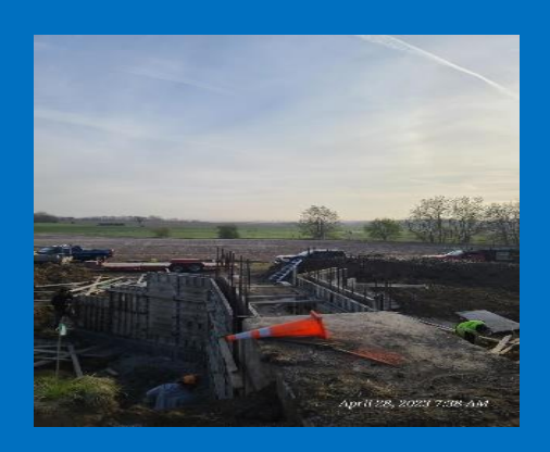
Culvert Ext. Wing Walls Forming for Top