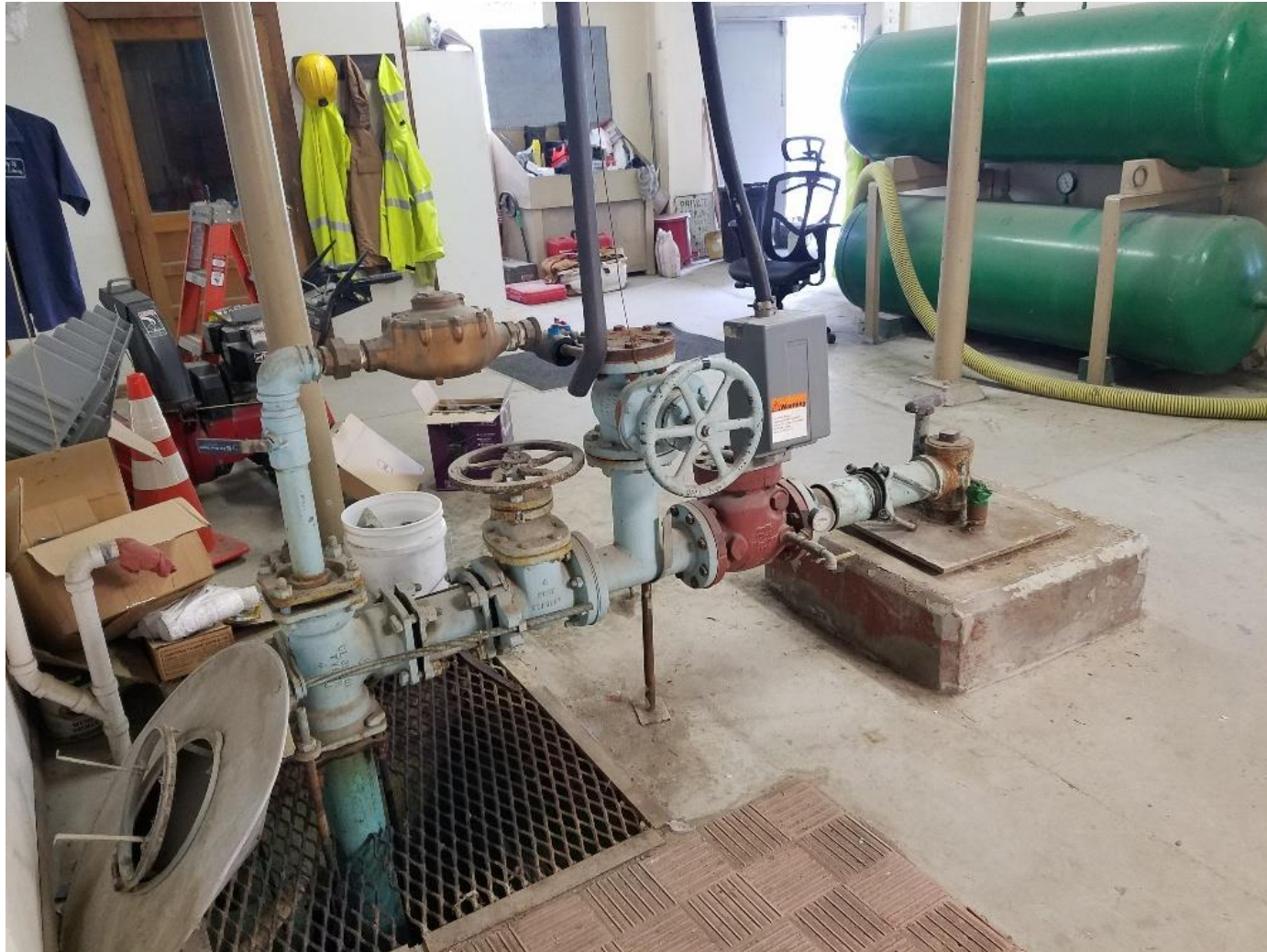
Existing Well No. 2 and Pump