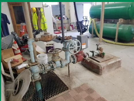
Existing Well No. 2 and pump inside pumphouse