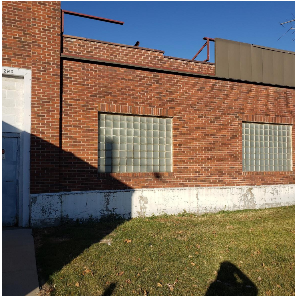
Location of new exterior door to pumphouse