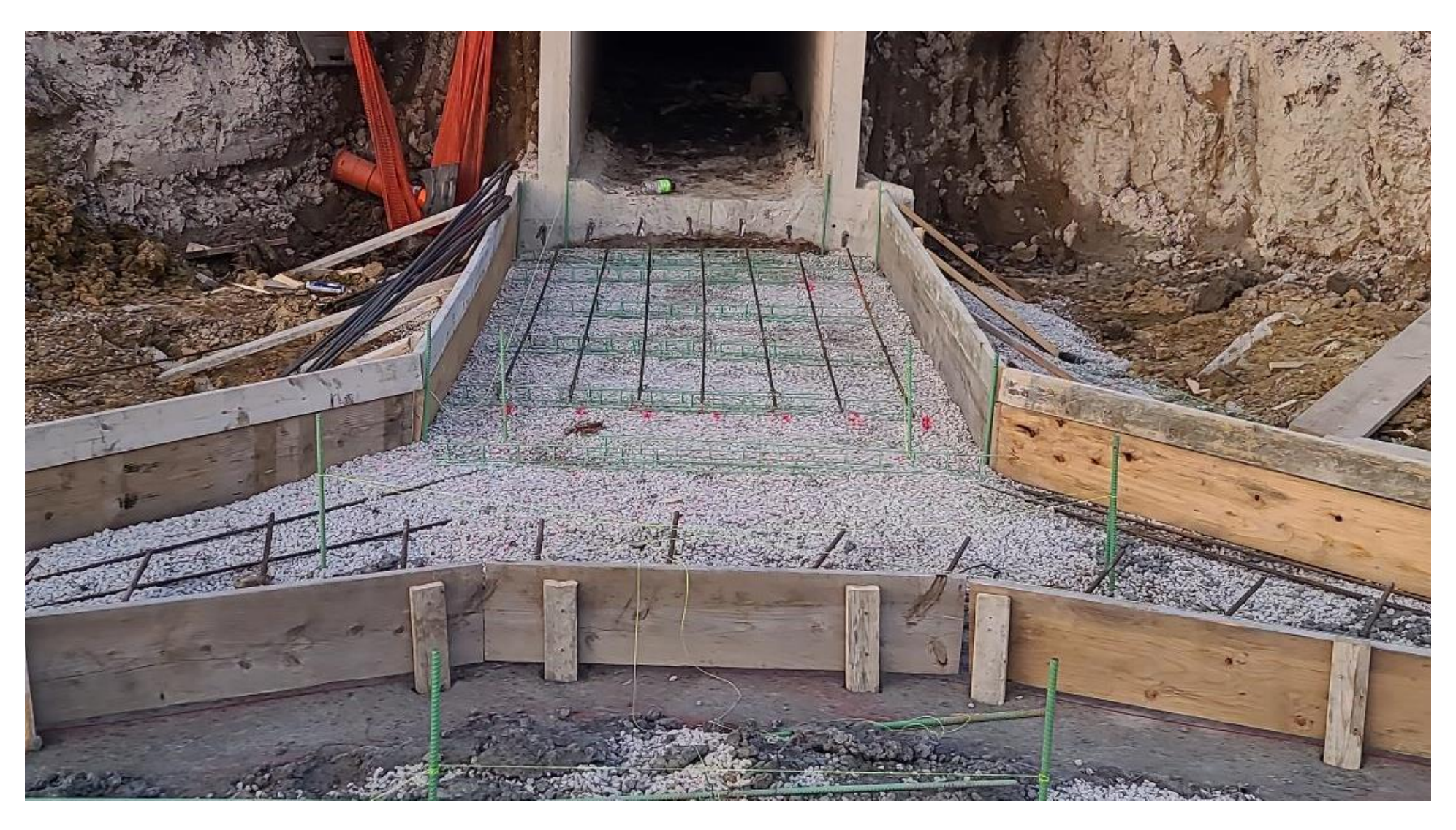
Box Culvert Extemnsion

West Liberty Rainbow & Maxson Project Weekly Project Newsletter