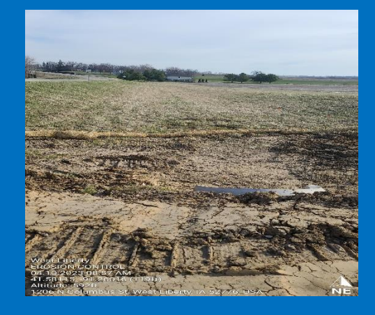
Erosion Control Installed