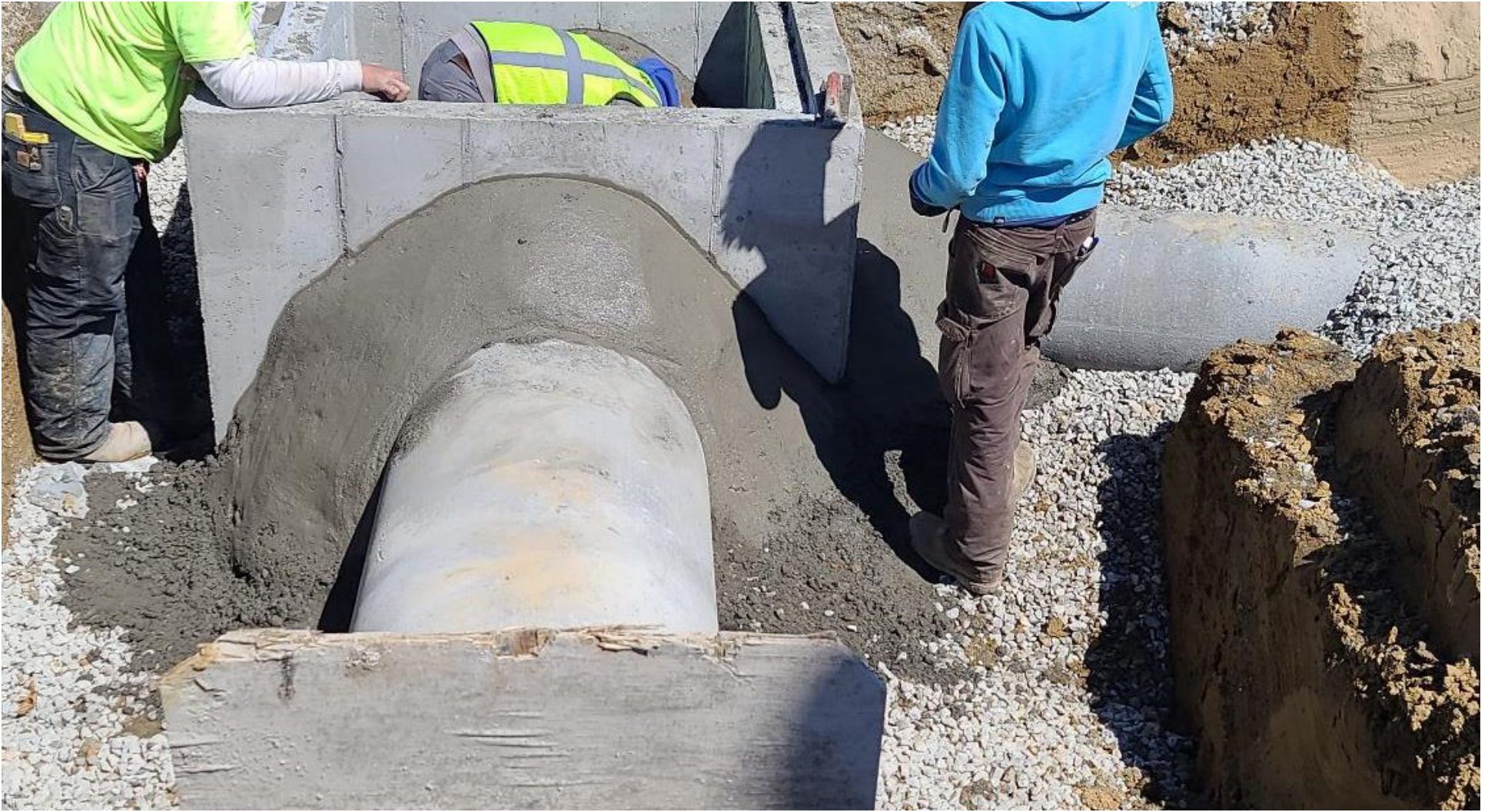
Storm Sewer Structure

West Liberty Rainbow & Maxson Project Weekly Project Newsletter