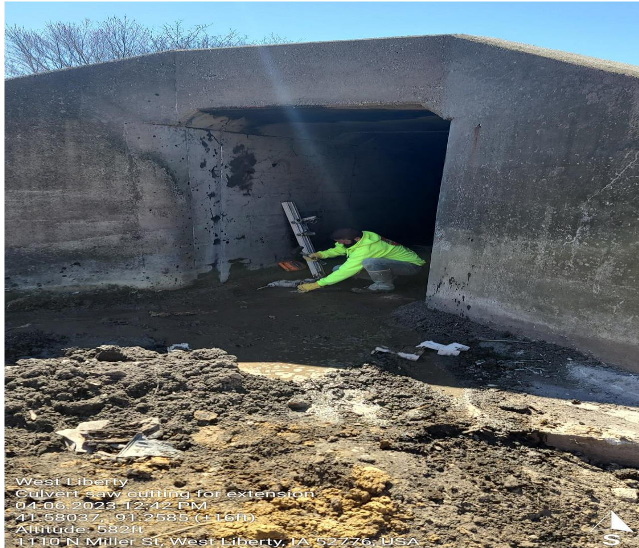
Box Culvert Extension

West Liberty Rainbow & Maxson Project Weekly Project Newsletter