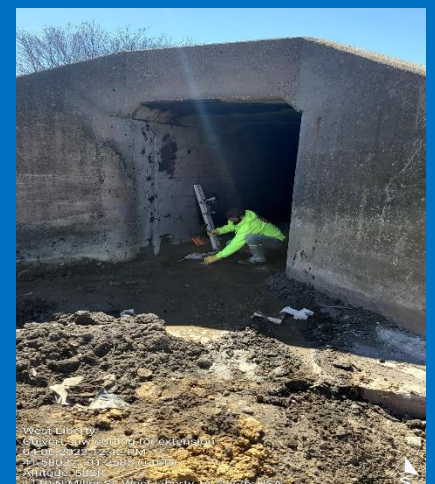
Box Culvert Extension